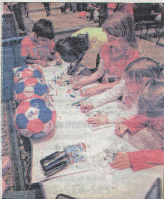
Kids enjoyed many inflatable mazes Saturday at Family Fun Day at the New Bern Riverfront Convention Center.